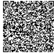
MCJ Screening Hall